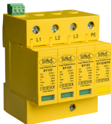
Part No. SY123/50KA4P