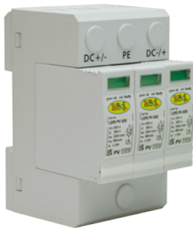
Part No. LSPD PV600 600V DC

When we are looking protecting an installation against over voltage, we have to give some consideration to external cables entering the building. PV installations will come in to this bracket. SPD's for PV systems are to protect the inverter and the fixed installation, therefore PV SPD's should be installed on the DC side of the PV system, before the inverter. These will always be Type 2 devices, unless the building has an external lightning protection system and the correct separation distance to BSEN 62305-3 has not been maintained, where you would install a Type 1 SPD.