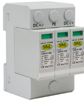
Part No. LSPD PV1000 1000V DC