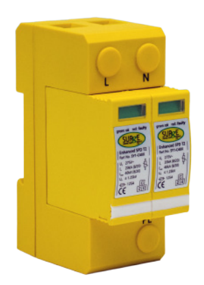
Part No. SY1C40X