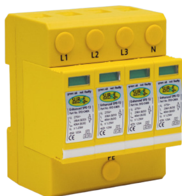
Part No. SY2C40X

Fully Compliant to BSEN61643-11, BSEN623005 & BS7671