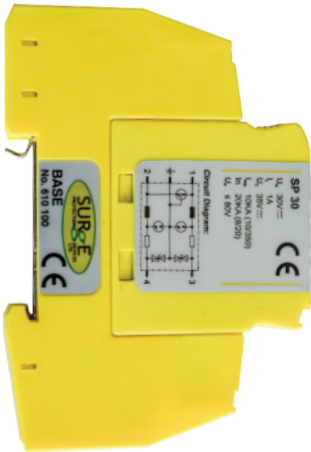
Part No. SP30