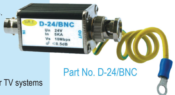
Part No. D-24/BNC