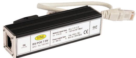
Part No. 630043