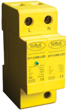
Part No. SY1C40XLED

Fully Compliant to BSEN61643-11, BSEN62305 & BS7671