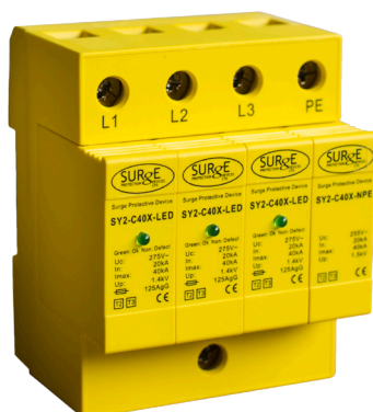
Part No. SY2C40XLED

Fully Compliant to BSEN61643-11, BSEN62305 & BS7671